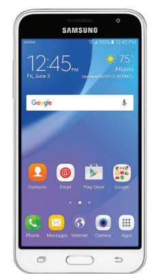
SAMSUNG Galaxy Amp prime